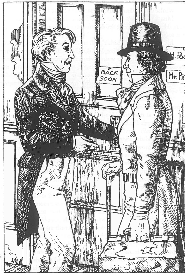
'Why, you are the boy I fought in Miss Havisham's garden!' Herbert exclaimed.

'Don't you know?' Herbert replied. 'It's a very strange story. Mr Jaggers is your guardian, isn't he? He's Miss Havisham's lawyer too, and he knows all her secrets.'