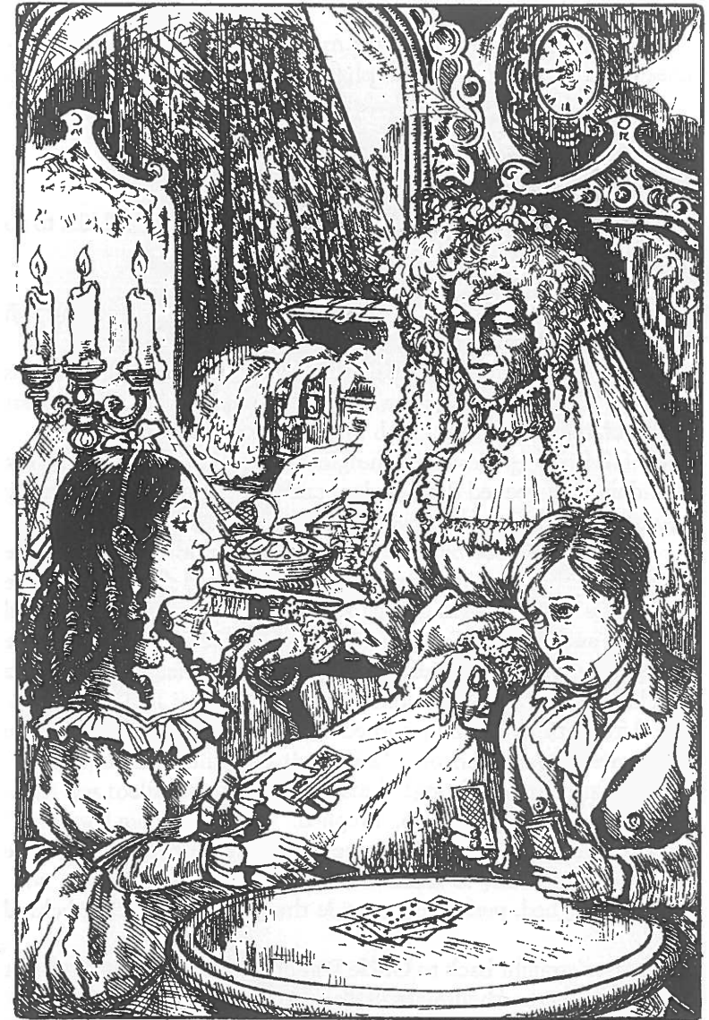
'What rough hands this boy has!' Estella exclaimed, as I held the cards. 'And what heavy boots he's wearing!'

'Why don't you answer her, Pip?' Miss Havisham said at last. 'She says cruel things about you. What do you think of her?'