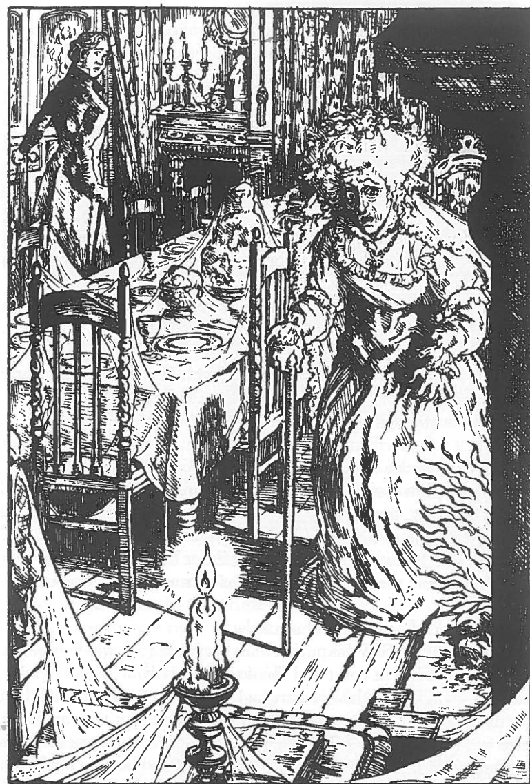
As I turned to go, a great flame sprang up suddenly from the fire. The flame leapt onto Miss Havisham's old, torn clothes.

I pulled off my heavy coat and threw it over the screaming woman, pushing her down. Then I dragged the cloth from the table