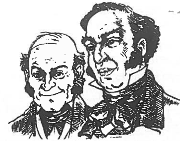
Wemmick Mr Jaggers