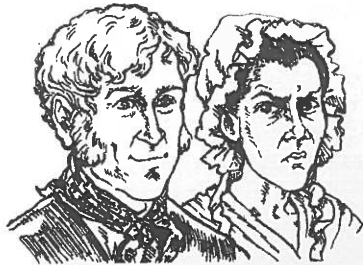
Joe Gargery Mrs Joe