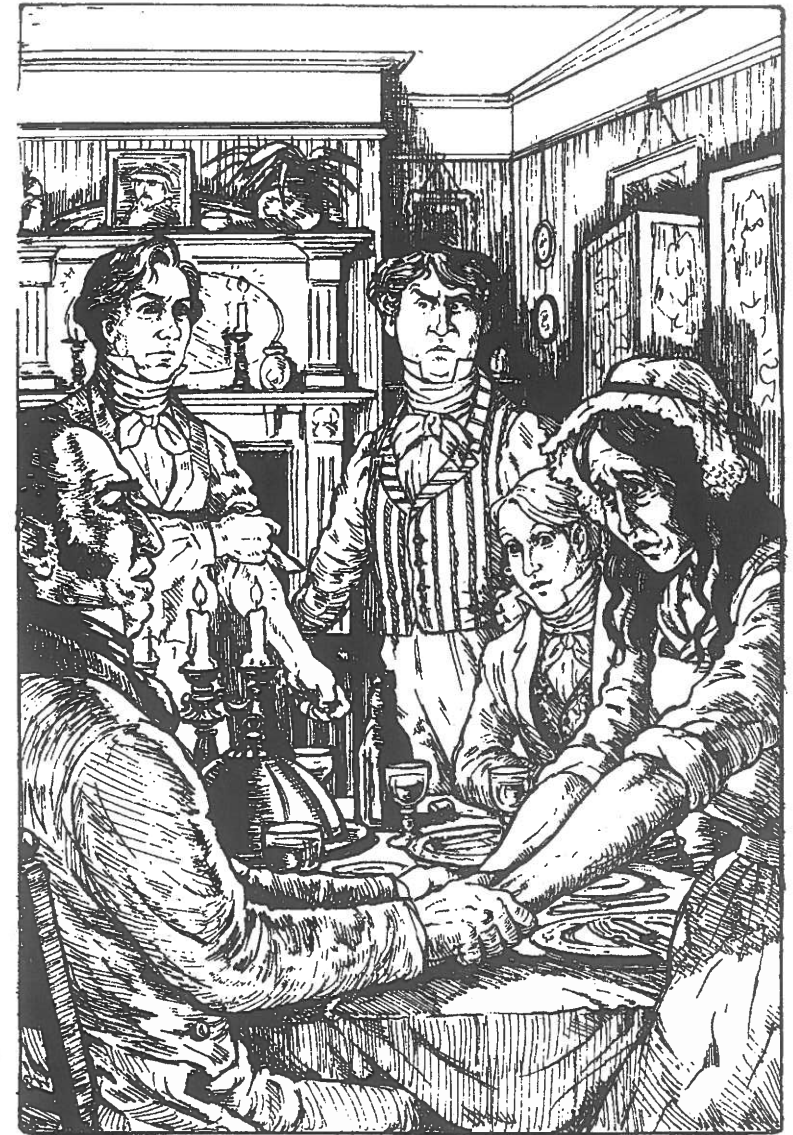
'There's power in those wrists,' Mr Jaggers said. 'Few men have the strength this woman has.'