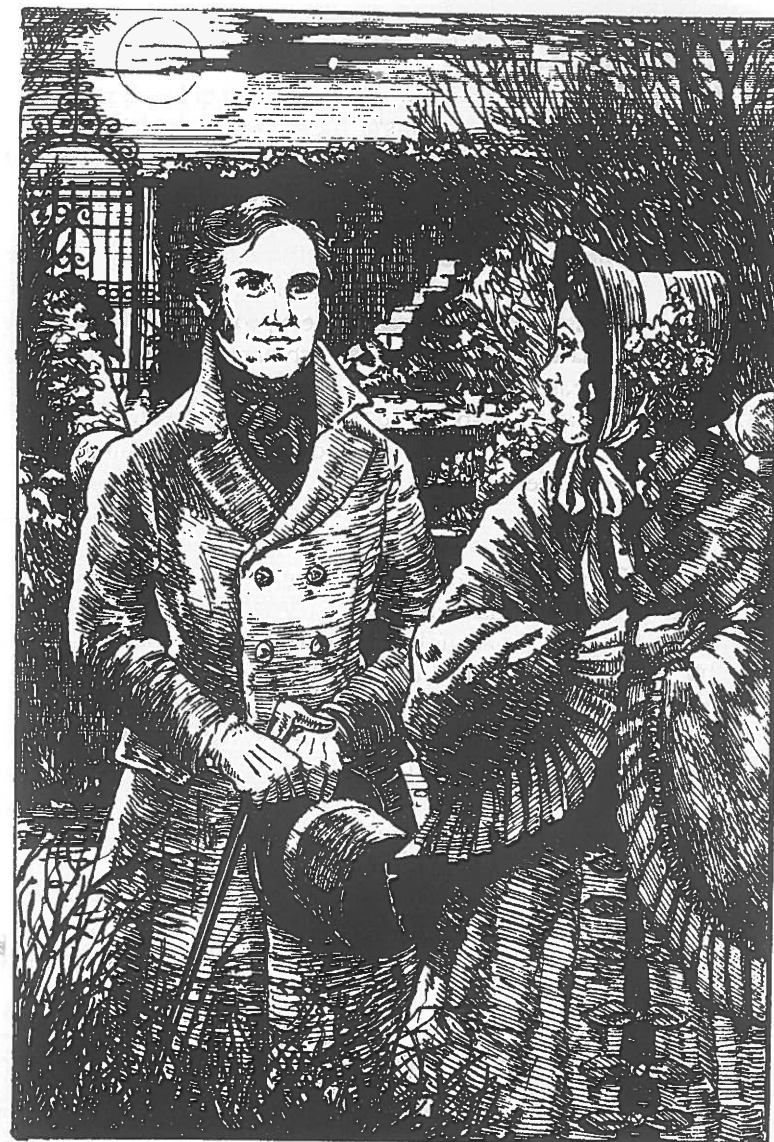
A woman was walking in the garden. As I got closer to her she turned and spoke my name.

Estella smiled. I held her hand and we walked together out of the overgrown garden. And I knew that, this time, we would never, never part.