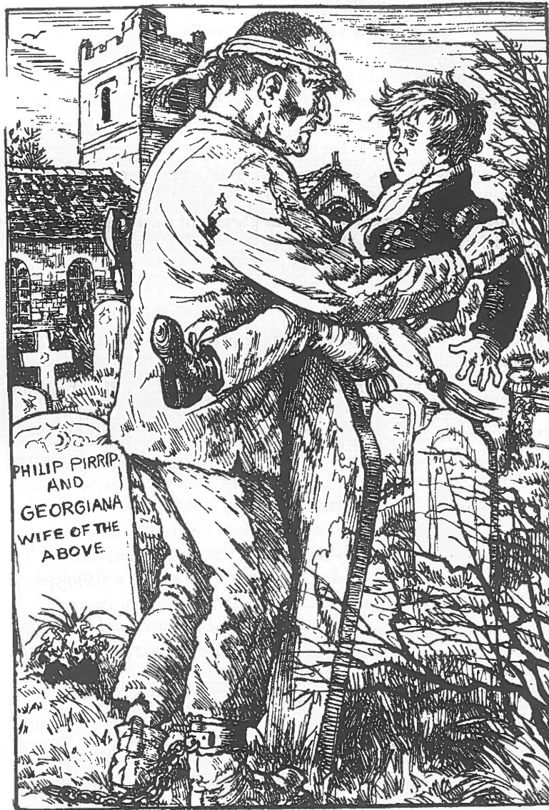
He took hold of my arms and tipped me back over the gravestone as far as I could go. His terrible eyes stared into mine.

man repeated slowly. 'Bring them to the Old Fort 5 , over there, by the river. Say nothing to no one and maybe I'll let you live.